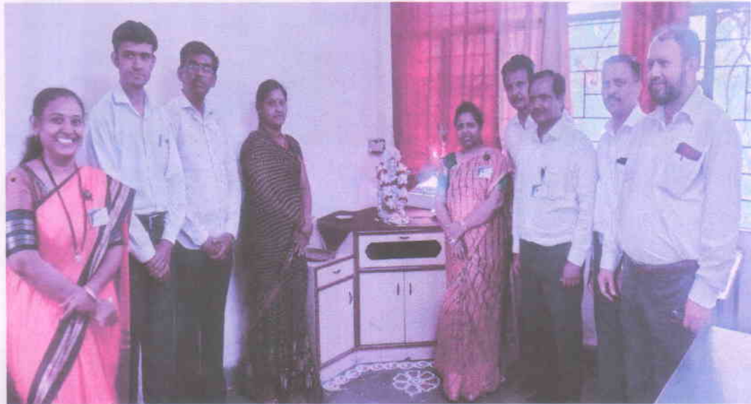
All HOD's and Parents