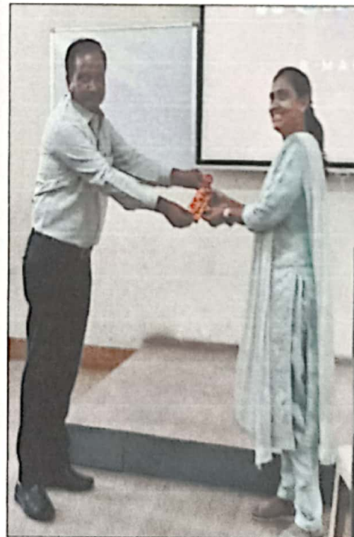
Felicitation of Ladies Faculties

Plot No.37, N-4, CIDCO, Aurangabad-431003(M.S.);India.Phone (Principal)(0240)2473742;