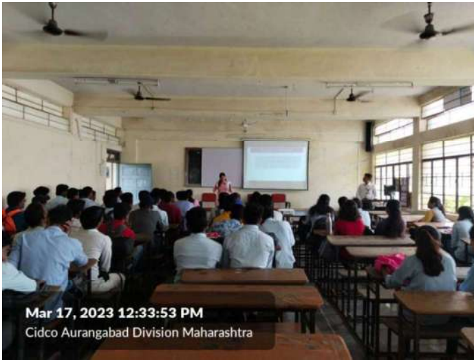
Mar 17, 2023 12:33:53 PM Cidco Aurangabad Division Maharashtra