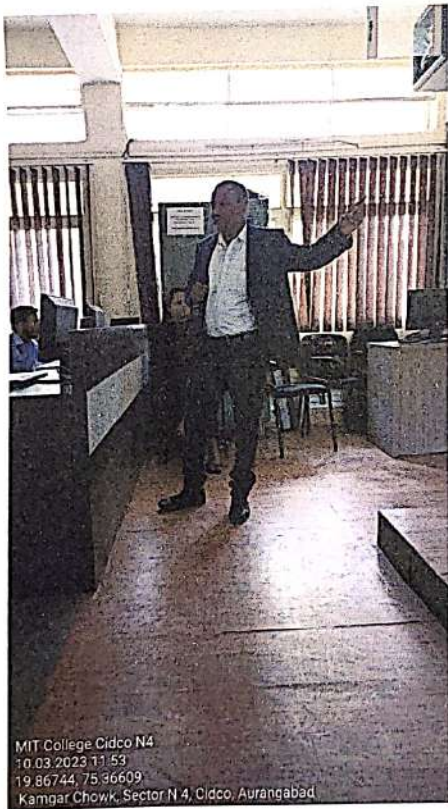
MIT College Cidco N4 10.03.2023 11:53 19.86744, 75.36609 Kamgar Chowk, Sector N 4, Cidco, Aurangabad