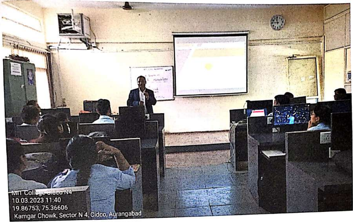
MIT College Cidco N4 10.03.2023 11:40 19.86753, 75.36606 Kamgar Chowk, Sector N 4, Cidco, Aurangabad