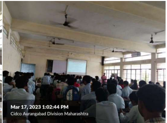
Mar 17, 2023 1:02:44 PM Cidco Aurangabad Division Maharashtra