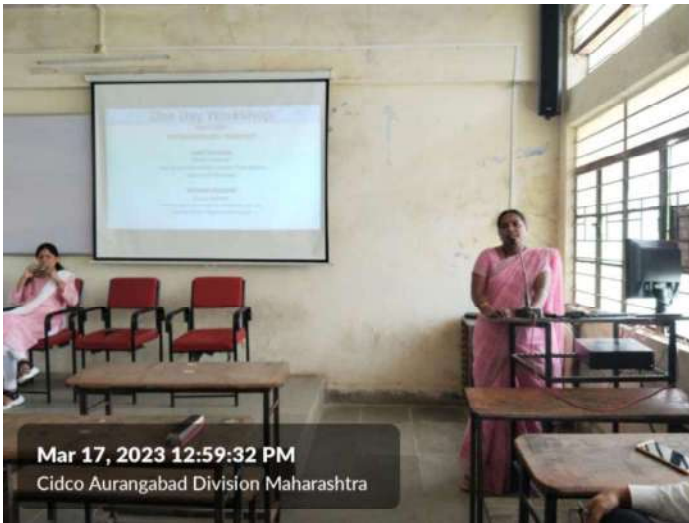
Mar 17, 2023 12:59:32 PM Cidco Aurangabad Division Maharashtra