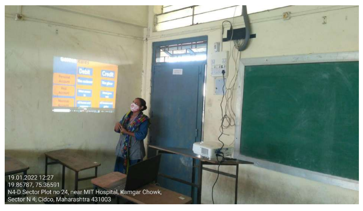
Class Room- C 5