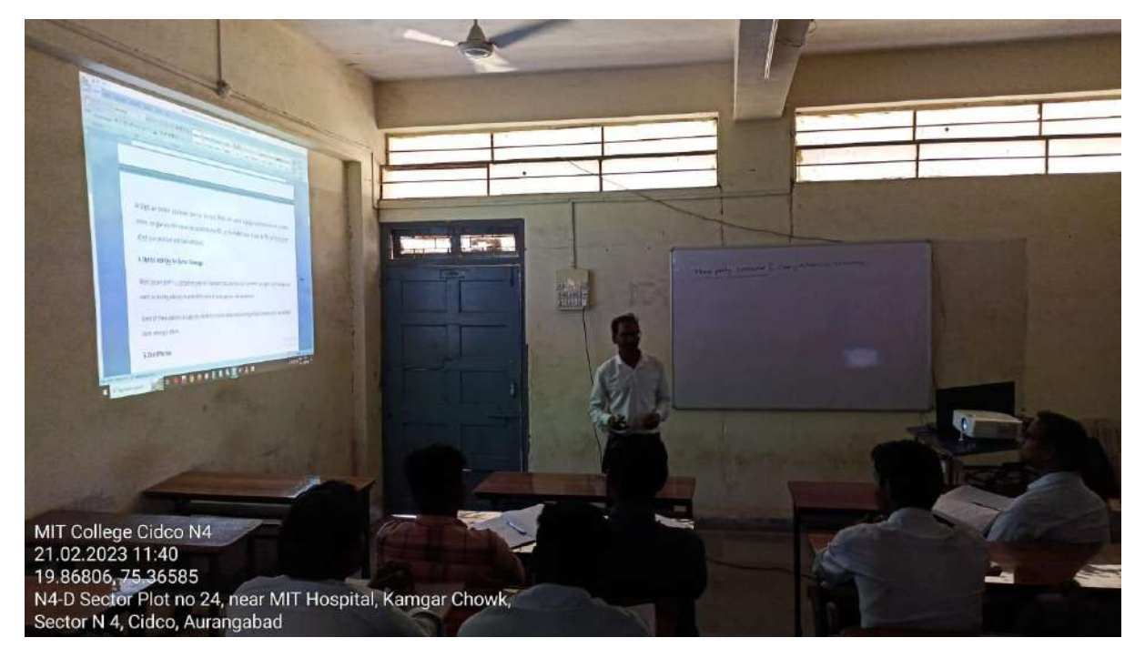
Class Room- C1